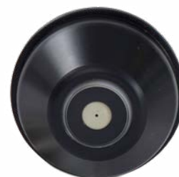
Round Spray Air Cap